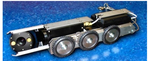
TRANSTAR II (SHORT BODY) SERIAL NUMBERS START WITH T9TXXXXX-V3 / T9U / V3A