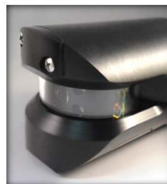
OMNISTAR PROBE SERIAL NUMBER START WITH C1A2