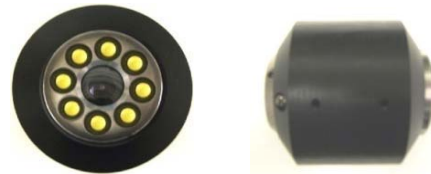
15XX SERIES SERIAL NUMBERS START WITH C3J / C3K / C3N / C3S