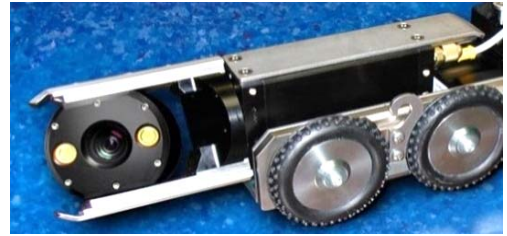
TRAKSTAR II (SHORT SQUARE BODY) SERIAL NUMBERS START WITH C1E2