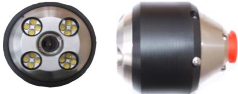
1306 SERIAL NUMBERS START WITH C3E