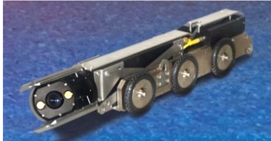
TRANSTAR SERIAL NUMBERS START WITH T8N / T8S / T9N / T9S / T9T / V2A