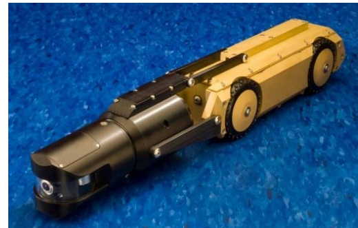
MINI TRACTOR SERIAL NUMBERS START WITH D3B