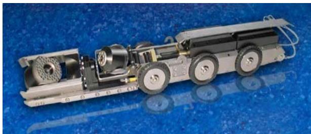
LATERAL LAUNCHER GEN 2 SERIAL NUMBERS START WITH ZOOM CAMERA = C2D2 TRANSPORTER = D6M 1545 LAT W/SONDE CAMERA = C3S